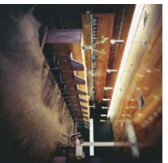
EXISTING POOL & GAMES FACILITIES TO BE REPOSITIONED WITHIN REVISED & UPGRADED BAR FACILITIES. EXISTING GAMES AREA TO BE RE-USED AS ENLARGED ADMINISTRATION TEACHING AREA/RECRE.