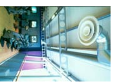
PROPOSED NEW SINGLE STOREY NEW EXTENSION TO CLUB TO CONTAIN MIXED USE FACILITIES INCLUDING SQUASH COURT & FITNESS SUITE.