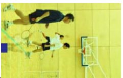
MAIN HALL TO BE UPGRADED TO BECOME A MULTI PURPOSE FUNCTION ROOM PROVIDING FACILITIES FOR MORE DIVERSE PLATES AS WELL AS EXISTING TRADITIONAL FUNCTIONS.