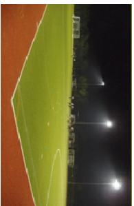
PROPOSED NEW THIRD GENERATION SYNTHETIC TURF PITCH, INCLUSIVE OF PERIMETER SECURITY FENCING & FLOOD LIGHTING.