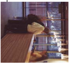
EXISTING RECEPTION TO BE UPGRADED & MADE MORE ACCESSIBLE TO ALL.